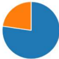
Boy and Girl Breakdown, What is stopping you from reading?