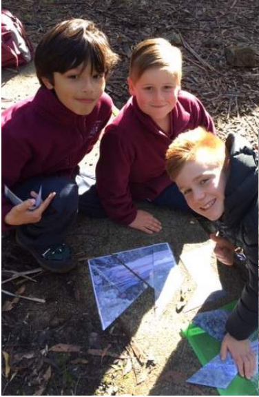
Tuning in & finding out at Hollybank

SUSTAINABILITY LENS: ...whilst considering how they can maintain and improve environments both now and in the future.