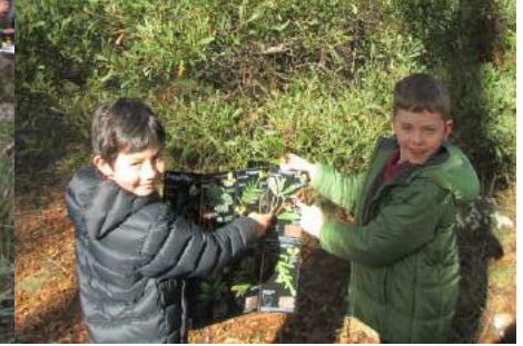
Finding out by being collaborative researchers